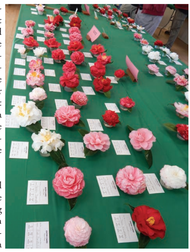
43 Novice Bloom Entries

In addition to the usual classes of camellias, there were three flower arranging classes that give entrants an opportunity to create creative and beautiful camellia arrangements.