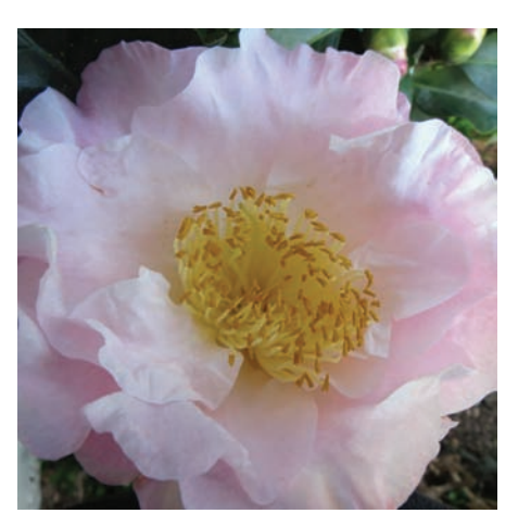
'Prima Ballerina'