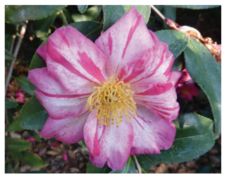
'Stars N' Stripes'

One of the better 'Tama-No-Ura' seedlings is 'Tama Americana'. It is the whitest of the nine Tama varieties introduced by Nuccio's. The medium semidouble rose red flower has a wide white border with occasional petaloids. This lovely flower is a tribute to America. The mother or seed parent was 'Tama-No-Ura' which the Nuccio's imported from Japan in 1978. It has a small to medium single red flower with a white border and sets a multitude of seeds. While not all of its seedlings will have a white border, some will inherit this genetic characteristic. The father or pollen parent is unknown for the nine Tama cultivars introduced by the Nuccio's because they let the bees do the pollinating. It is good that eight of the nine of these varieties begins with 'Tama' as it tells us its mother. The exception is 'Merry Christmas' introduced in 1991 before the other varieties were registered in 1993.