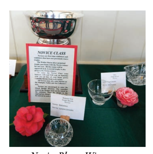
Novice Bloom Winners