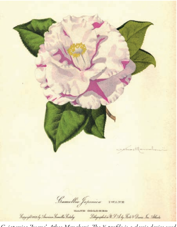
C. japonica 'Iwane', Athos Menaboni. The ¾ profile is a classic device used in botanical art to convey the most information about form. Menaboni's composition of Iwane also features a triangular arrangement of leaves which is very pleasing to the eye.

The lithographs produced in the American Camellia Catalog are all "hand colored". At the time, it was actually cheaper to hire students to hand paint each lithograph rather than pay the exorbitant cost of color printing. Painting would be done under the strict supervision of the original artist. The hand coloring of Menaboni's lithographs was done by students from the University of Georgia.