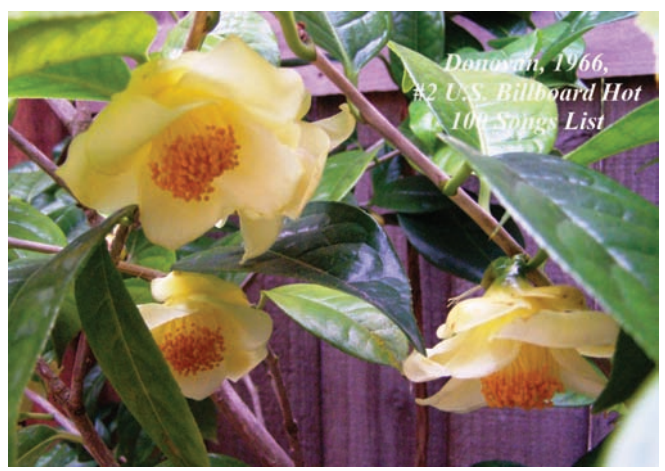
C. nitidissima grows and blooms in our garden at last! Originally planted in August, 2004 and moved in February, 2012, she took the slow and mellow road to blooming!

Whether or not you're mad about Saffron, Fourteen, (or Fontine, we're too young to get into the debate), or the Scottish Band, Donovan, most camelliaphiles we know have gone CRAZY for the new yellow camellias from China. The most common and widely grown variety is Camellia nitidissima. also known as Camellia chrysantha - the golden flower camellia.