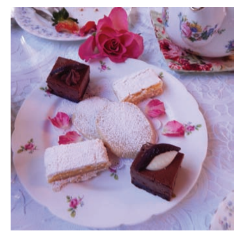
Four Seasons Tea Sandwiches and Dessert