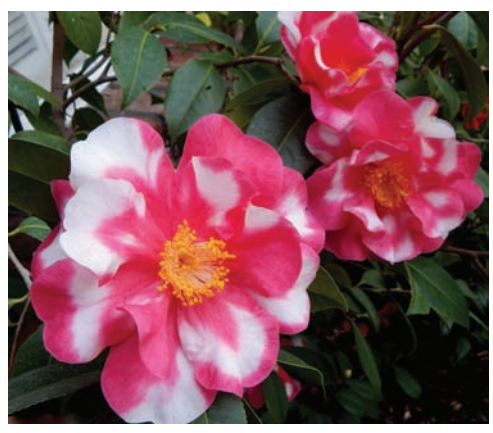
'Frank Houser Variegated'

'Frank Houser' and 'Frank Houser Variegated' the last several years. Like real estate, location, location, location is a key to growing a superior camellia. When a well rooted plant coupled with good culture has an optimal in-ground location a superior camellia will bloom show winning flowers treated, natural, single, in trays of 3 and 5 like blooms. Since many people grow 'Frank Houser' and 'Frank Houser' and 'Frank Houser Variegated ' a variety of people win with these very large red flowers. Therefore, it takes a super