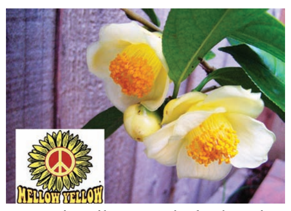
C. nitidissima blooms next to a logo from the period

This 5-meter-tall plant was first botanically described by Mr. Chin Wen Chi in 1948, but was not located in the wild until the 1960s. This new 'mellow yellow' grower from Yongning, Guangxi Province in southern China and also found in north Vietnam created quite a stir, both in botanical classification circles and the camellia hobby itself.