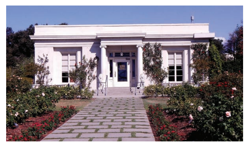
Rose Garden Tea Room at the Huntington

tiny sandwiches with the crust removed? Tea time is an experience to be enjoyed with friends and loved ones. Birthdays, anniversaries, holidays, graduations are memorable when celebrated at tea time. Romance and love are kindled when we partake of high tea. Where are some of the best places in the Pasadena, California area for tea time?